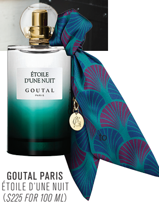
GOUTAL PARIS ÉTOILE D'UNE NUIT ($225 FOR 100 ML)